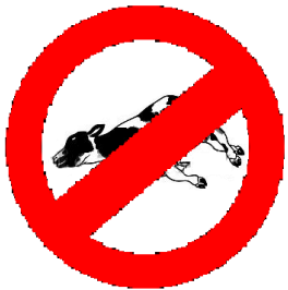
Availability Carcasses Post Bovine spongiform encephalopathy