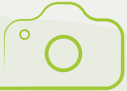
PHOTO CONTEST nature over BORDERS